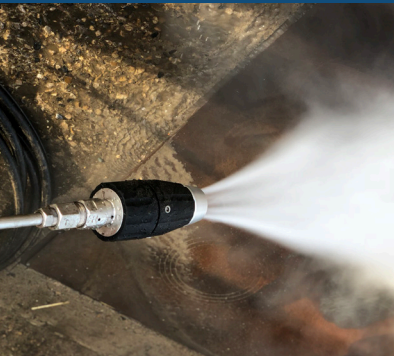
Ultra-Impact Nozzle 3000