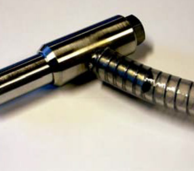
Sand Blasting Equipment